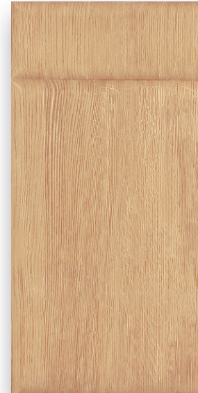
Weathered Natural Blonde