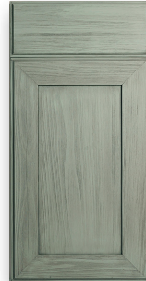
Autumn Moss (Silver Birch)