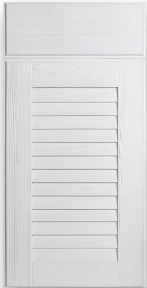
Lunar White (Super White)