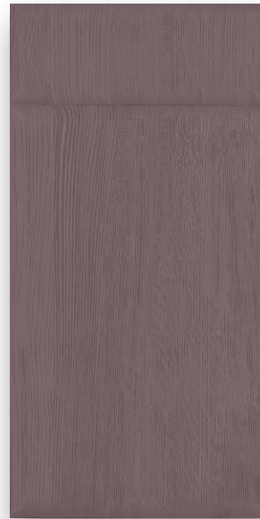
Custom Painted Finish